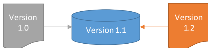
Figure 1: Forward and backward compatibility

An openfunds database is said to be forward compatible if it is capable of processing data from a more recent version of itself. This is the case, for example, when the receiving database is running on openfunds version 1.1 but is capable of processing data from a database containing openfunds fields from version 1.2. The following diagram illustrates this situation: